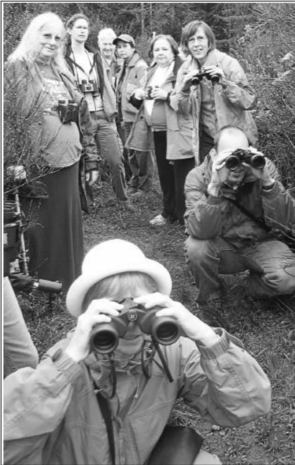
Local birders recently took a walk through Echo Heights, spotting a number of interesting species and learning more about the environment.